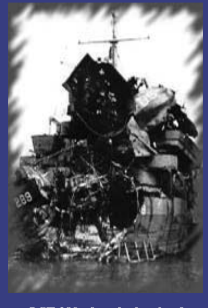
LST 289 after the battle of Exercise Tiger

"Freedom is a fragile thing and is never more than one generation away from extinction. It is not ours by inheritance; it must be fought for and defended constantly by each generation, for it comes only once to a people. Those who have known freedom and lost it, have never known it again." — Ronald Reagan