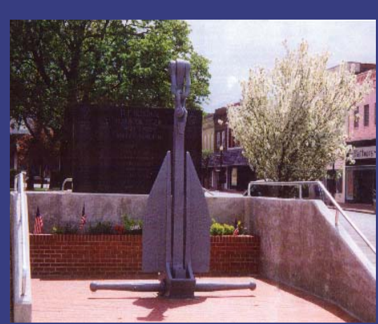
Exercise Tiger Army & Navy Anchor Memorial at Audrain County Courthouse, Mexico, Missouri.

Walking the beautiful town square of downtown Mexico, Missouri, visitors are surprised to come upon a ship's anchor permanently mounted on display at the northwest corner of the grounds of the Audrain County Courthouse. This anchor is the foundation of the Exercise Tiger Army & Navy Anchor Memorial and serves as a reminder of the sacrifice that more than 200 Missourians, 8 from Audrain County, made during World War II as American soldiers and sailors prepared to help liberate France from the Germans.